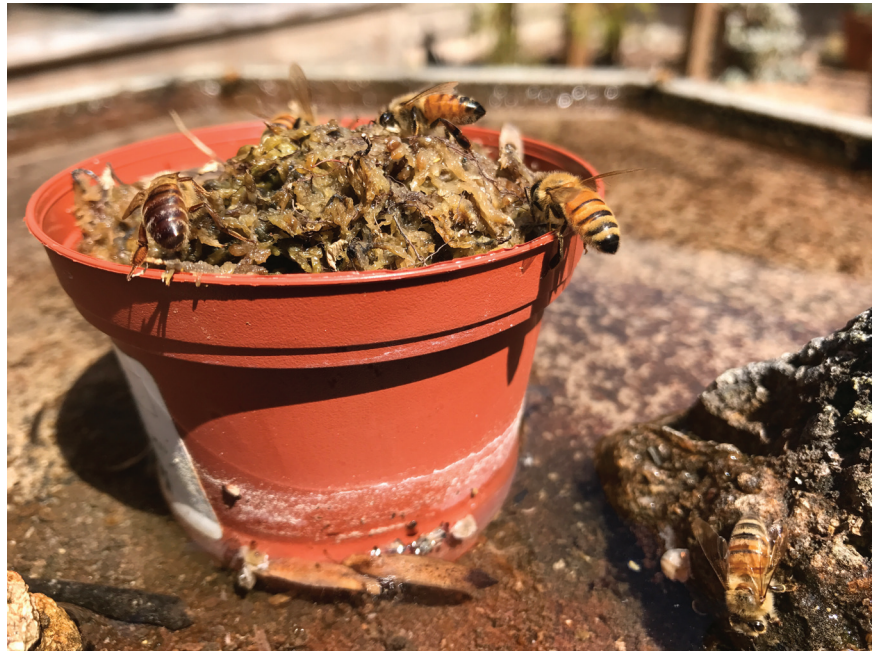
Figure 3. Your bees will visit your neighbor's birdbath.

3) People are going to call you crazy when they find out you are a beekeeper, usually behind your back, but sometimes to your face. News flash: they are right. Think about it. Most humans on the planet are scared senseless of stinging insects, almost to the point of amusement to those of us who have conquered that fear. Not beekeepers though; we are fearless and jump straight into a beekeeping hobby, craft, or job that many would consider among the scariest things they could do. That makes us different, at least a little. A commercial that once played on TV reminds me of beekeepers. In that commercial, a city was on fire, being bombed to rubble, etc. The city's citizens were running from that city in shock, fear, and disarray. Enter the U.S. military.