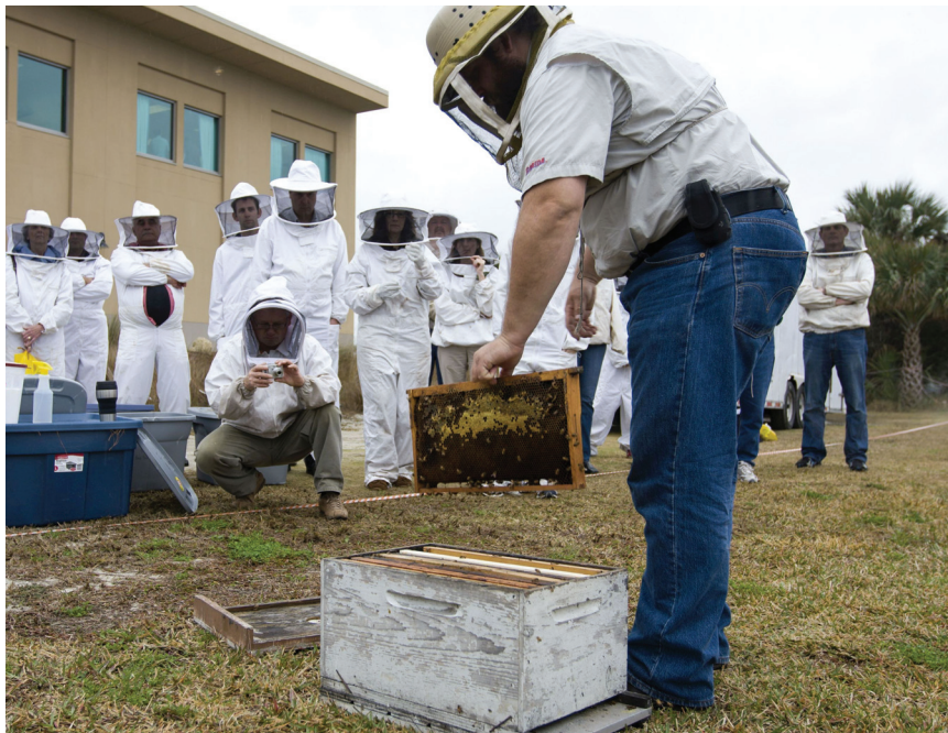
Figure 4. You are going to want to be around other beekeepers.

5) You are going to want to be around other beekeepers (Figure 4). There is this interesting myth that floats around the beekeeping industry. The myth goes something like this: "Beekeepers are solitary individuals; they like to be alone." I speak at beekeeper meetings all around the world and I can suggest that this statement is patently false. Beekeepers like to be around other like-minded individuals. So, it is ok if you get the urge to go to beekeeper meetings, both large and small. It is ok if you join beekeeper chat rooms, list serves, etc. You will want to be around other beekeepers. Some will disagree and say that commercial beekeepers would much rather be alone. Perhaps they like to work alone, but they do not like to be alone. Test this by shadowing a commercial beekeeper for one day. Their phones ring non-stop, with all of the calls being placed by other commercial beekeepers who want to chat about the latest