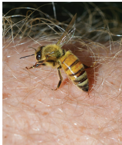
Figure 1. You will get stung.

time Sunday evening, after church. All I had to do was feed them; but somehow, I managed to get stung through a glove during my first visit to my first colony. I was happy to have it over and also happy that it was not nearly as bad as I thought it would be (much like the realization that a shot is not all that bad once you actually have it). I remember going back to my mom (my