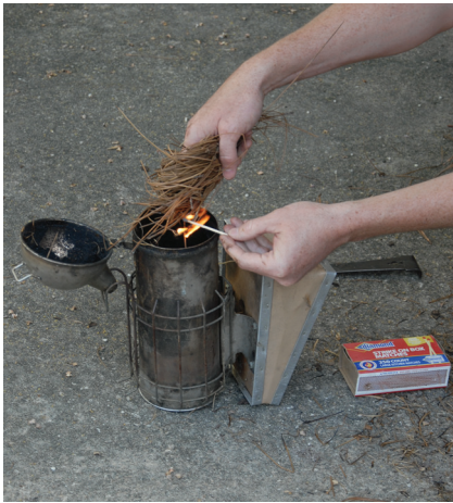
Figure 2. Your smoker will go out when you most need it.

improperly lit smoker is doomed to go out when you are working your meanest colony. You do not really want that to happen.