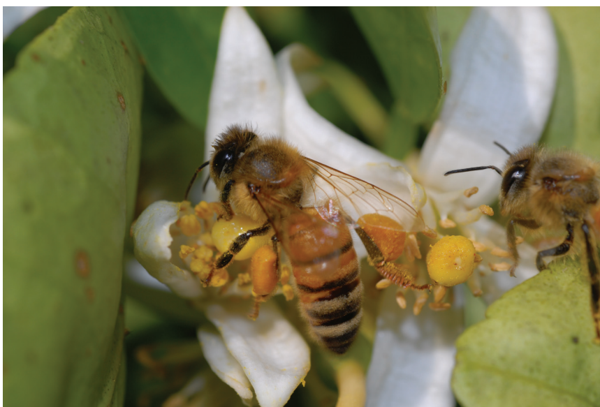
Figure 8. You will be asked to provide bees to pollinate someone’s garden or fruit trees.

keeper if you walked into my house, unless, I guess, you rummaged through my wife’s underwear drawer.