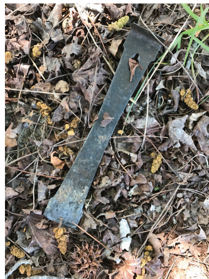
Figure 7. You will lose your hive tool.

17) Someone is going to want you to be their mentor. Occasionally, you will discover that there is someone out there who is just as strange as you are. That person, upon finding out you are a beekeeper, will want you to teach them the ancient techniques used in the craft. They want to be a beekeeper, and they want you to be the one who teaches them. This person may come to you because they want their garden pollinated. They may come to you because they heard bees are dying and they want to help. For whatever reason, they have chosen you