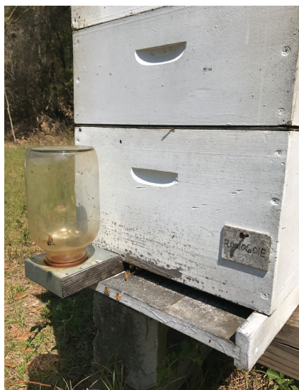
Figure 6. You will have to feed your bees, at least at some point.

in spring. I had to feed them to get them to make it to fall, when Spanish needle provided what they needed to survive winter. I share this long story to note that feeding bees is something all beekeepers have to do at some point. We are working with a living creature, often at densities that are not natural (i.e. a lot of colonies kept in the same place), in an environment where they are not native. Sometimes, we just have to feed them.