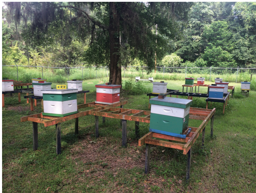
Figure 11. You will want more bees.

24) Some of your colonies will die. I feel like this one is necessary to include in my list of shared beekeeper experiences because of the common myth that bee colonies can live indefinitely as long as we manage them appropriately. To kill that myth,