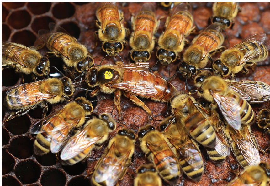
Figure 5. You are going to kill a queen.

11) You will kill a queen (Figure 5). All beekeepers are aware that colonies should be worked slowly and methodically, both in an attempt to keep the bees calm and to limit damage to the bees or their nest. Working colonies slowly and with purpose also minimizes the chance that you will damage the queen. Despite this, queens occasionally drop from the frame onto the ground dur-