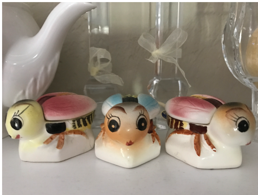
Figure 9. You will be given more bee-themed paraphernalia than you can handle.

21) You are going to want more colonies (Figure 11). I always tell beekeepers that they should start with at least three colonies. I do this for a few simple reasons. First, having a few colonies helps you know when a certain colony is underperforming. You do not seem to notice this when you have only one. Second, you can use the resources of the other colonies to help the struggling colony. It takes me quite an effort to talk people into starting with three colonies. However, it takes considerably more effort to talk them into stopping there once they have them. Many people who become beekeepers simply cannot have enough bees. I like this trait in an individual, but it comes with a few potential drawbacks. First, the beekeeper may