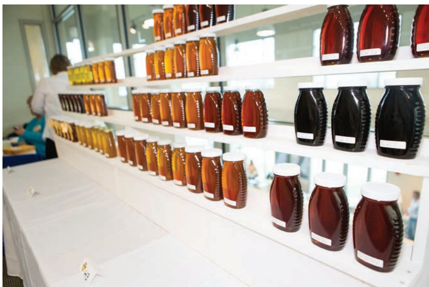
Figure 1 – Liquid honey. Notice all the varieties and colors of honey on display.

4) Creamed honey – Creamed honey is honey that has undergone controlled crystallization (Figure 3). Honey is a supersaturated sugar solution. Consequently, the sugars can come out of solution, causing honey to granulate, or to turn into a sugar-based solid. Honey that granulates naturally usually contains large, coarse sugar crystals. Creamed honey, on the other hand, has much smaller crystals, making the final product spreadable like butter at room temperature (when everything goes right). A pound (0.45 kg) of creamed honey goes for $5 - $16. So, a colony producing