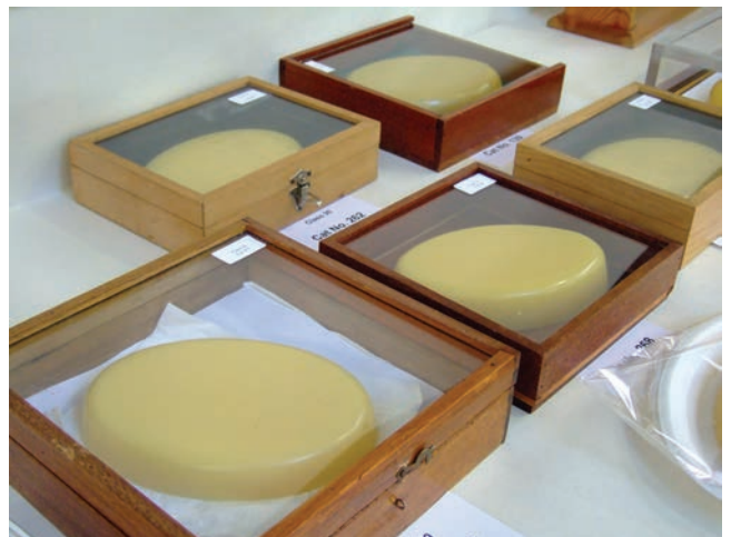
Figure 7 – Wax cappings (a) and block wax (b). The cappings (a) and newer comb produced by bees can be used to make blocks of wax (b). In turn, these blocks can be sold “as is” or rendered into specialty wax products.