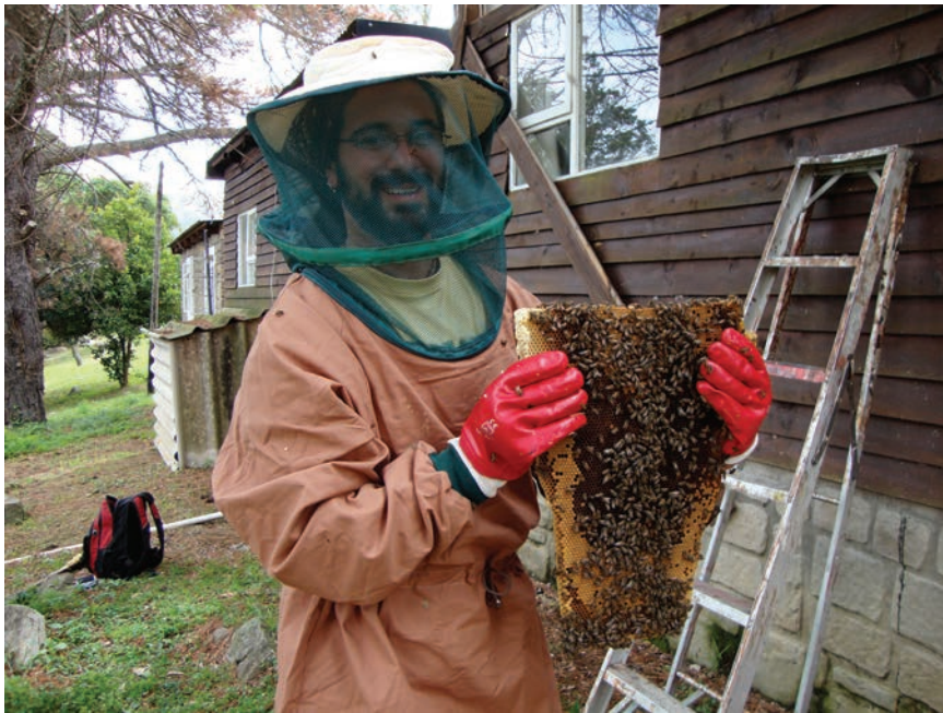
Figure 9 – Colony removal. Removing colonies from places where they are unwanted is a good and growing business for many beekeepers.

the management of their own hives. One of those ways is removing feral colonies from places that they are not wanted (Figure 9). Individuals providing bee colony removal services need special training and equipment in order to provide this service for others. In many states, removing bee colonies from a structure is considered pest control, in which case those engaging in this service would need a pest control license. In other states, it is not considered pest control, so the bee removal specialist can remove the colony from the structure as long as he/she is not killing the bees (at which point it would become pest control). Because of this, it is important that those engaging in this activity check with local and state laws to determine how it is legislated in a given area. Removing colonies can be