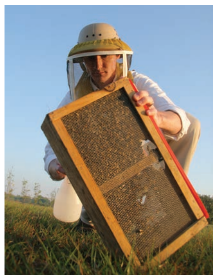
Figure 14 – Selling package bees. Package bees also are in high demand. They tend to be seasonal in nature and command a fairly high price.

25) Bee-related art – Honey bees feature prominently in art. I have traveled all around the world, visiting museums of all types. It never ceases to amaze me how common it is to see honey bees or beekeeping portrayed in stained glass windows of major cathedrals, in paintings by notable artists and in sculptures from antiquity. Even today, many hobby beekeepers are artists in their professional lives, and this gives them the opportunity to combine two of their most cherished loves. The world is hungry for honey bees. One of the ways to satiate this hunger is to provide the satisfaction of seeing bees and beekeeping portrayed in art. Some of you reading this article have this skill set and have discovered that producing and selling bee-