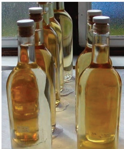
Figure 5 – Mead. Mead is an increasingly popular specialty hive product.

7) Mead – Mead (Figure 5) is an alcoholic drink produced from the fermentation of honey. Historians tell us that honey is the first ever fermented product. People apparently had been fermenting honey long before they began fermenting anything else. Perhaps the best example of this is in the