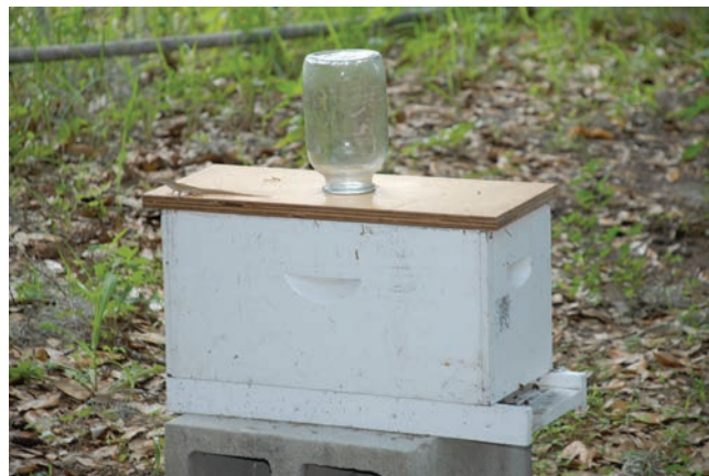
(l) Figure 12 – Selling full size colonies. This can be a lucrative business for those willing to put in the time to grow strong colonies. (r) Figure 13 – Selling nucs. Selling nucs also can be a lucrative business. There is an extremely high demand for nucs; consequently, many beekeepers are getting into the business of selling nucs.

growers meet their pollination needs and make a little income at the same time.