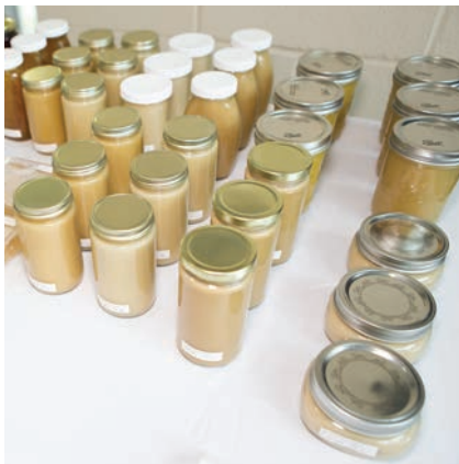
Figure 3 – Creamed honey. This is usually a great tasting and very spreadable honey. Making it right requires patience and practice.

the national average of 58.9 lbs (26.7 kgs) of honey can produce $294.50 - $942.40 worth of creamed honey.