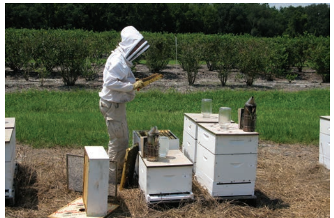
(l) Figure 10 – Managing hives on behalf of others. This is an increasingly popular way to make money with bees. In this scenario, the beekeeper is paid to manage someone else's colonies. Usually, the individual wants to have bees to make honey or pollinate their garden; yet, they are unwilling to keep bees themselves. Enter the willing and entrepreneurial beekeeper. (r) Figure 11 – Pollination. Many commercial beekeepers rent their colonies to growers to provide crop pollination services. In this photograph, the colonies are being used to pollinate blueberries (seen in the background).