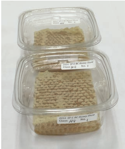
Figure 2 – Cut-comb honey. Cut-comb honey can be easy to make and a highly prized way to sell honey.

the national average of 58.9 lbs (26.7 kgs) of honey can produce $294.50 - $942.40 worth of creamed honey.