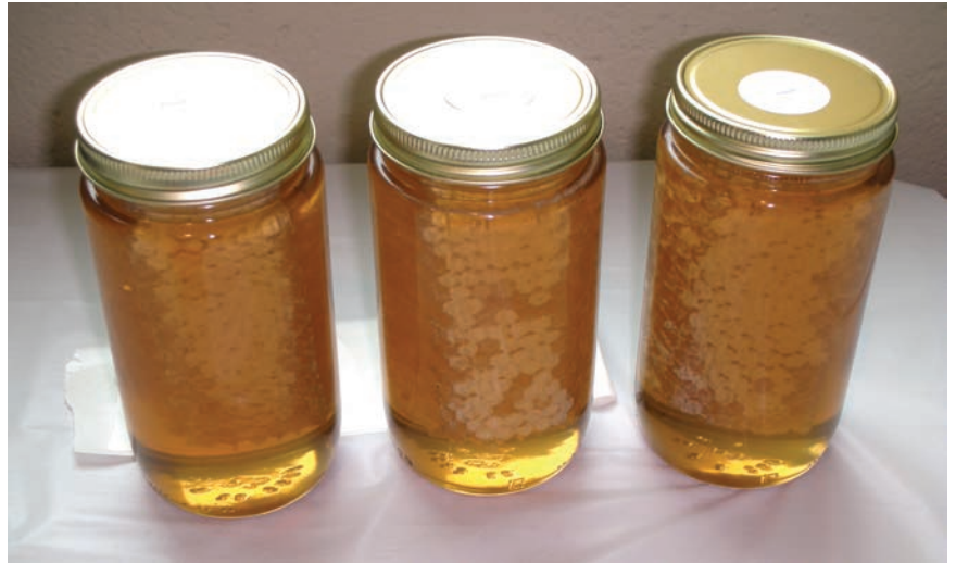
Figure 4 – Chunk honey. This happens to be my favorite honey product. It is in high demand with consumers.

6) Honey bottler/packer – A honey bottler/packer is an individual who purchases honey wholesale from other beekeepers, bottles it (some call this “repackaging”),