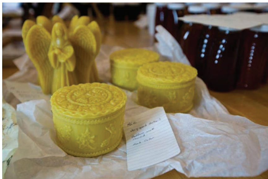
Figure 8 – Ornamental wax. Wax can be rendered to make candles, ornaments, and other trinkets. Its uses seem nearly limitless.

13) Block beeswax – Worker honey bees secrete wax from special glands located underneath their abdomens onto a section of the abdomen called the “wax plate.” The wax flakes off the plates in scales that the bees collect with their mandibles and shape it into the wax cells and cappings of those cells. For the beekeeper, marketable wax is generated, usually, from dead-out colonies, cappings from cells containing honey (Figure 7a), and from burr comb the bees sometimes build in gaps in the nest. The wax is washed, melted, filtered and molded for use. One of the most popular uses of beeswax for beekeepers is the block of beeswax (Figure 7b). A pound (0.45 kg) of beeswax is sold for $3 - $10 wholesale. In most cases, wax is an “extra” for beekeepers, meaning that most beekeepers do not manage colonies to produce wax, rather they just harvest it because it is a byproduct of harvesting honey, of a lost colony, or of old/damaged combs. I suspect the average colony produces less than 1 – 2 lbs (0.45 – 0.91 kg) of wax per year for beekeeper use. Thus, the production of block wax usually is not a way for beekeepers to generate a reliable income, though it can be a great income supplement.