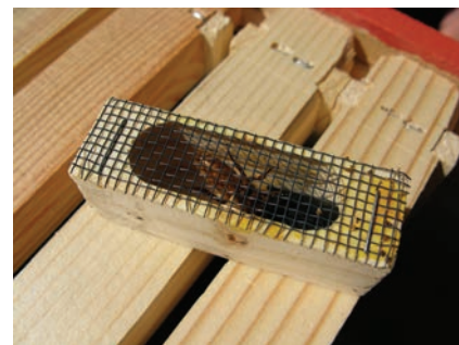
Figure 15 – Selling queens. All honey bee colonies need a queen. The supply of queens is not meeting the current demand.