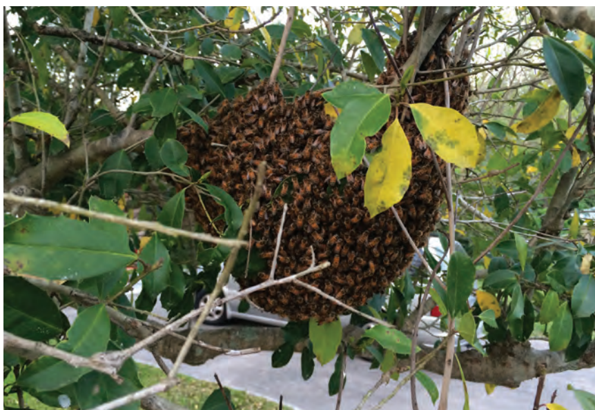
Figure 4. A swarm of bees clustered in a tree. This small cluster is only about the size of a basketball and may contain around 10,000 bees.

Bees vote for a given nest site by visiting the site. This happens in a series of steps. First, different scout bees advertise multiple potential nest sites in an area. A single scout alternates between dancing for her site and revisiting the site between dances. Unlike humans, scout bees seem to present an honest assessment of the site they are visiting, with no bias toward the site just because they found and are proposing it. They only