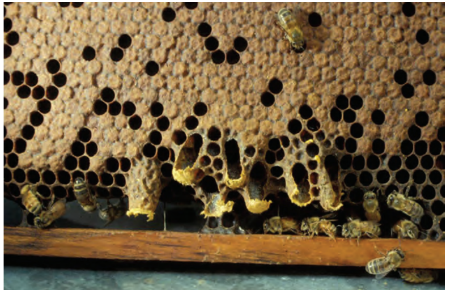
Figure 5. Swarm cells at the bottom of a frame. A virgin queen emerged correctly from the cell on the left (the tip of the cell is open) and killed her sisters while they were developing in the cells (the queen cells were opened from their sides). These cells suggest that the swarm has happened already and that the colony will not swarm again. How can this be known? The placement of the queen cells on the perimeter of the brood comb suggests that they are swarm cells rather than supersedure cells. The fact that one is opened from the tip suggests a virgin queen has emerged and replaced the swarming mother queen. Swarm cells opened from the side suggest that the virgin queen is not going to swarm with a secondary swarm given that no replacement queens for her remain alive.

It only takes the swarm about 60 seconds to diffuse from its holding pattern, the cluster, and begin to fly to its new home once the best site is identified. How this happens is quite interesting. Only the scout bees that were looking and dancing for a nest site are warm enough to fly (bees must warm their flight muscles before they are able to fly). These bees will trigger the warming up of the other bees by pushing their thoraces onto cool bees and emitting a vibration that can be heard as a piping noise. This lasts 0.5 – 1 second. Essentially, the piping scout bees are telling the other bees to “warm up, it is time to leave.” At some point, the scout