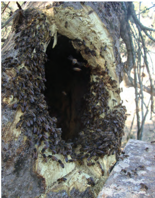
Figure 8. Honey bees at the entrance of a newly occupied nest. This colony of bees recently moved into this nest – notice how no comb can be seen in the nest cavity.

The arrival of the swarm at the new nest site means the swarm has completed its journey and now is ready to build a new home. The scout bees land at the site, stand at the nest entrance (Figure 8), and release a pheromone from the Nasonov gland. This pheromone is a homing pheromone, calling the other bees into the new nest. The landing swarm of bees seems to flow into the nest entrance much like water flows through a funnel into a container. The swarm process is complete. The swarming bees have a new home and the parent colony has reproduced itself successfully.