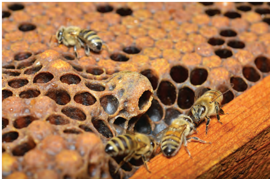
Figure 1. A queen cup. The comb on which the queen cup has been built is leaning back to the left. In its proper orientation, the opening of the queen cup would be pointing down.

This part of swarm biology is quite interesting as a number of questions regarding the necessity of swarm clusters arrive. For example, why do bees need to form a cluster during the swarm process? Why can they not simply choose their new nest site while still in their original nest and then fly straight to the nest site when they swarm? The answers to these questions are not fully