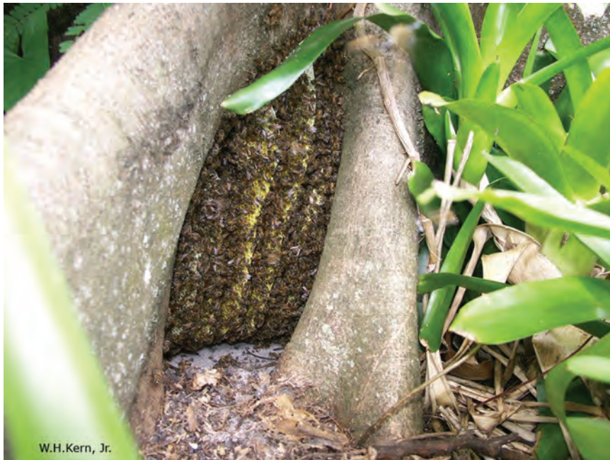
Figure 7. A less-than-ideal nesting site. These bees, which happen to be African honey bees in southern Florida, chose a less-than-ideal nest site. Though they are nesting in a tree, the nest is close to the ground and contains a very large entrance. It likely was the best of the available nesting sites.