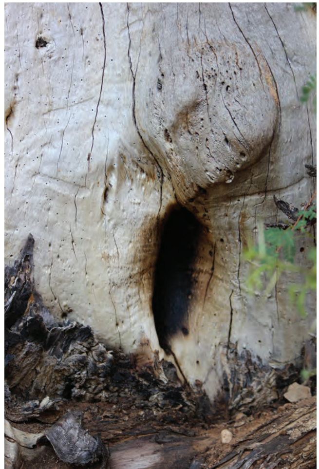
Figure 6. An opening leading to a potential nest site in a tree.