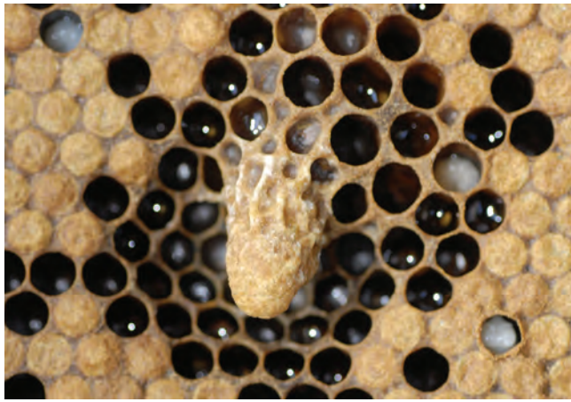
Figure 3. A ripe swarm cell. Beekeepers consider a queen cell to be “ripe” when it is capped.

reproductive female in the nest. Occasionally, the colony can be of sufficient population that the first virgin queen to emerge will swarm with a subset of the remaining workers. This is called the secondary swarm. The next virgin queen to emerge also may be a part of a third (tertiary) swarm. Tertiary and additional swarms are less common than the first (primary), and usually only, swarm.