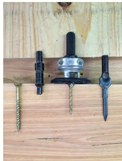
Figure 8 – A screw (left) and the various bits used to drill and/or countersink pilot holes. The bits in the middle and on the right do both while the bit on the left only drills the countersink hole. The bit on the right is for illustrative purposes only. It drills a pilot hole that is too big for the screw shown in the picture.