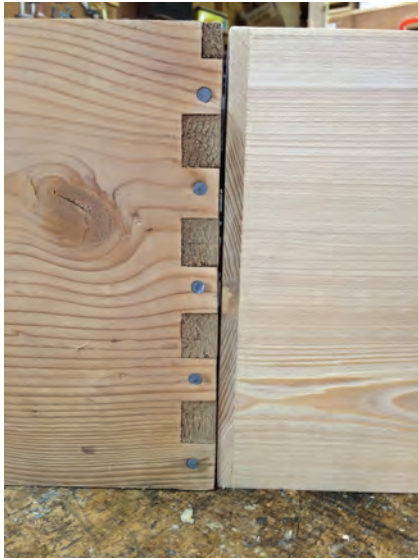
Figure 3 – The side faces of rabbet- (right) and box- (left) jointed, deep supers. This side of a rabbet joint needs no nails/screws but does have exposed end grain down the entire side (strip of wood to the left of the seam in the super on the right) and includes a visible seam. The box-jointed super accommodates five additional nails/screws on this side, exposes additional areas of end grain (wood “boxes” between the nails), and has a considerable, visible seam (the zigzag crack) exposed.

damage. Take a look at the joints of the two deep supers shown in Figures 2 and 3. Both figures include a super having a “box” joint, where two sides of the super interlock much like fingers in a clasped hand. Box joints are slightly different from “dovetail” joints where the interlocking fingers are tapered. Both figures also include a super having a type of “rabbet” joint which is where one side of the super fits snugly into a special groove cut into the adjoining side of the super (the special groove can be seen in Figure 4). The end result of a rabbet joint is a joining of the two sides at a simple, straight line, or seam, that is present only on one side of the super. On the other hand, a super with box joint has a seam that zigzags down both faces of the interlocking sides. I have never done the math, but there is easily two-to-three times more surface area to protect on a box joint than there is on a rabbet joint.