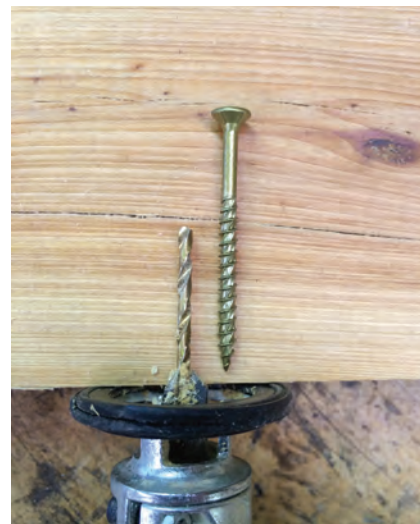
Figure 7 – Drill bits used to drill pilot holes should be the same diameter, or slightly smaller, than the shaft of the screw (without including the thread, or inclined plane, of the screw).

of wood. A powerful drill can spin a screw quickly through the wood. This force can cause the wood to split as the screw travels through it. Drilling a pilot hole in the wood first gives the screw a path through which it can travel, thus lessening the chance that the screw will split the wood. Pilot holes are easy to create. You simply need to find a drill bit that is about the same length and diameter of the shaft of the screw that you are using (Figure 7). It is important not to use a drill bit that is the diameter of the shaft + the inclined plane. It should ONLY be the same diameter of the shaft, not taking into account the in-