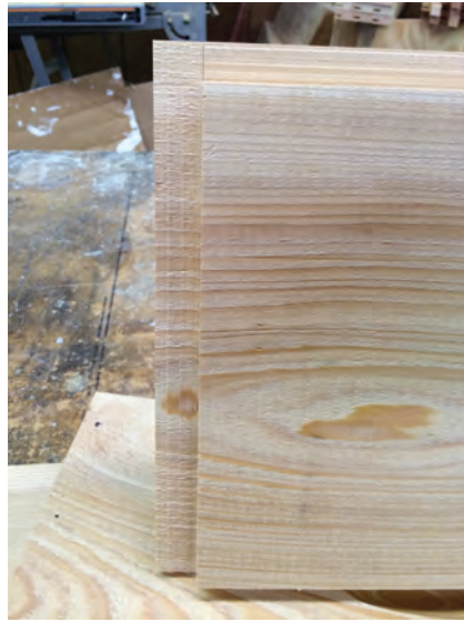
Figure 4 – A view of the inside surface of the front wall of a rabbet-jointed, deep super. Notice the grooved cut on the left of the board. The side wall of a super fits snugly into this groove.

Another disadvantage to using a box joint is the amount of end grain that is exposed to the elements. Wood is milled from trees that originally grew in such a way that channels were produced throughout the wood as tree rings were added annually. These channels run up and down through the wood (the tree), and allow the tree to transport nutrients throughout its structure. These growth patterns form the “grain” of the wood. Wood, typically, is cut “with the grain,” a process that makes the wood stronger. Consider the common 2×4 for example. A 2×4,