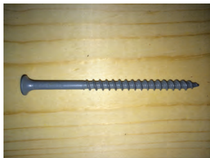
Figure 5 – A wood screw. The basic wood screw has a head and a shaft (or shank), the latter of which is about 2/3 rd wrapped with an inclined plane. The underside of the screw’s head is shaped like a wedge that tapers from its widest point just under the head to its narrowest point at the beginning of the shaft. The head of the screw contains a grooved pattern in which a drill bit fits, thus allowing the screw to be turned. Screws are sized by the diameter of the shaft (a measurement called the “gauge”) and the length of the overall screw. Shaft diameters get larger as their gauge numbers increase.

The basic anatomy of a screw is a metal shaft (or shank) wrapped with an inclined plane (the real power of the screw) and topped with a head (Figure 5). The inclined plane of the screw has the “teeth” or “thread” that cut into both pieces of wood, thus securing the screw’s hold. The inclined nature of the inclined plane pulls both pieces of wood together while the screw is being driven. I find that screws secure wood together tighter than do nails, and screws cannot back their way out of the hole over time as can nails.