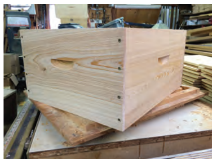
Figure 1 – A properly assembled super.

The Langstroth hive is simple in design. It is based on the use of one-to-three, roughly cube-shaped boxes, or supers, that form the core of the hive and to which additional supers can be added as the bee colony grows (Figure 1). Most beekeepers use hives made of wood. Of course, other options are available for hive construction materials, including plastic and Styrofoam; yet, wood remains the most popular construction material out of which hives are made.