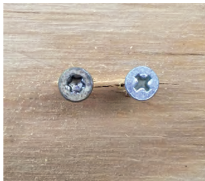
Figure 6 – The head patterns of two screws. The screw on the right accommodates the more common Phillips head bit (the “+” pattern) while the screw on the left accommodates a star bit.

The surface of the screw’s head contains a shaped groove or slot (the “female” end) that is made to accommodate a bit or tip (the “male” end) of a screwdriver or drill. Common screw types include the Phillips head, or cross-point (the traditional “+”-shaped groove, see Figure 6), and the regular head that contains a straight groove (the “-”-shaped groove, sometimes called “slot” or “flathead” screws). I used these types of screws all of my life until I met the star head screw (Figure 6). This screw head has a six-pointed groove that is the best screw type I have ever used. In my experience, the Phillips screws strip easily, especially when one does not use the exact bit needed to drive the screw. “Stripping” happens when the bit is not pushed firmly into the grooves in the screw head or it does not fit together appropriately. Pulling the drill trigger causes the bit to spin loosely in the screw head, thus grinding away the grooves in the screw’s head. Once the screw’s grooves are gone, the bit will not have anything to catch in the screw’s head. This makes the screw impossible to drive into the wood since the drill bit turns freely in the head rather than properly mating with the screw head and pushing it further into the wood. I have never had this problem with star bits. Furthermore, every box of star bit screws I have purchased has come with a bit in the box, thus ensuring that you get the right bit for the job. I will never use a Phillips or slot screw again.