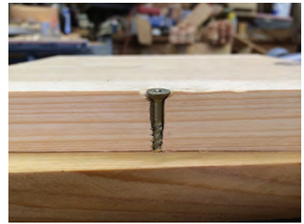
Figure 10 – A screw drilled correctly through a pilot hole. The pilot hole is too big for the screw, this done on purpose so that both could be seen. Notice how the head of the screw fits flush in the countersunk pilot hole and how the teeth (or inclined plane) of the shaft cut into the walls of the pilot hole.

Assembling supers with screws is important, but you also should use wood glue to hold the joints together even better. I highly recommend using wood glue on all super joints, prior to fastening the sides together with screws. The wood glue provides added reinforcement to the super’s joints, which will be under considerable pressure in the typical beekeeping operation.