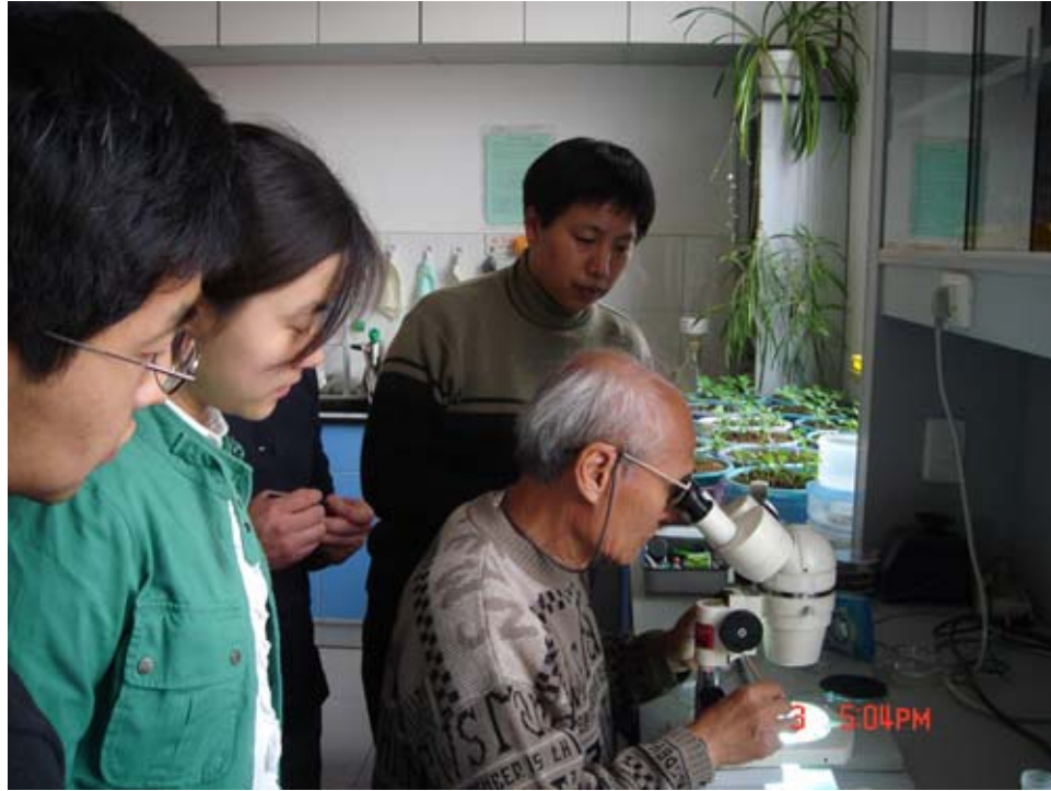
A class in laboratory